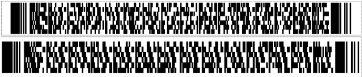
1 Sample of Data Version 3 2D Barcode generated by DOR.